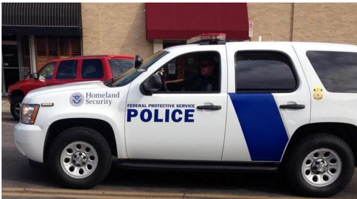
Federal Protective Service Police October 26, 2013 Grand Junction Colorado.